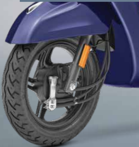
SYNC BRAKING TECHNOLOGY