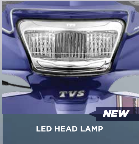
LED HEAD LAMP